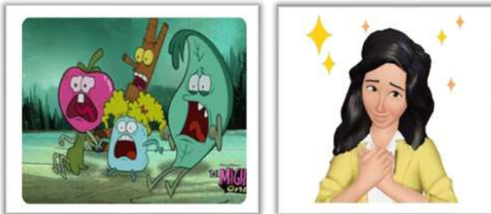
Figure 2: Non Translingual Comments (Appendix B)

Canagarajah (2022) said “translingual scholars have expanded their focus beyond words to other semiotic resources that participate in communication.” These two comments, although they cannot be identified, are from Pakistani youth or some other nationals. And they also do not fall into the category of translingual practices, but they show the creative use of semiotic mode to convey message. The first gif shows affection, and the second one shows that the person is shocked. As there are other ways to know the national identity of a commentator either through the username or profile display where different pictures are uploaded, but again, there are issues while identifying the national identity, like there are many fake names or pseudo names used and accounts can be kept private. That’s why only those comments are added, about which the researcher was sure that these are from Pakistani youth. Where the doubt arises, it is better not to assume things unless or until there are some reference- or inference-based cues available in the comments. There is another collage of comments from different posts that do not include Pakistani flag emoticons that will