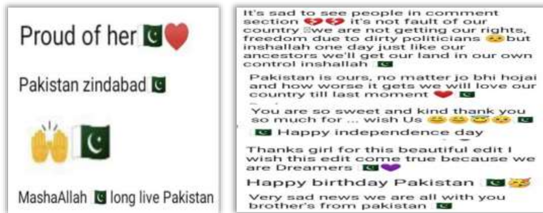
Figure 1: Comments with Pakistani Flag (Appendix A)

There are a total 41 comments, and the reason for putting them all together was similar kinds of visual modes. The purpose of analyzing these comments is to look out for specific linguistic, cultural, and personalized patterns of language use by Pakistani youth on Instagram posts.